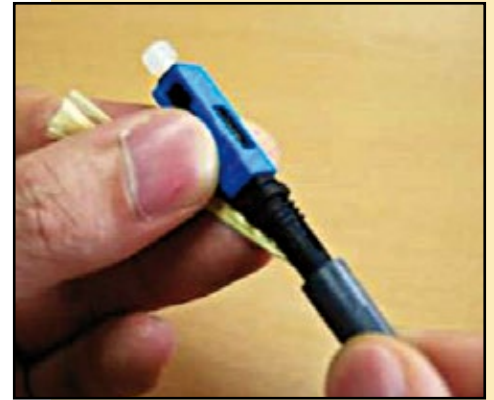
9. Lock the boot with yarn