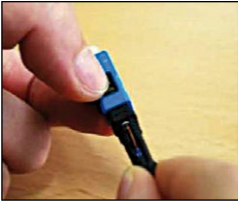
7. Press the button (yellow cover)