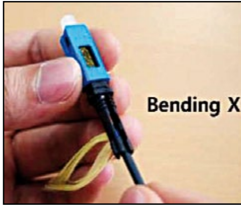
8. Release the bending