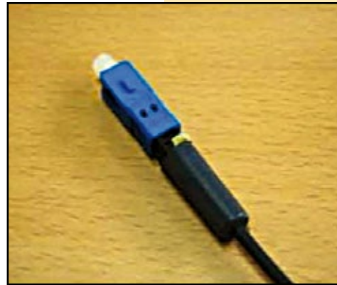
11. Completion assemble