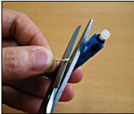
10. Cut the yarn